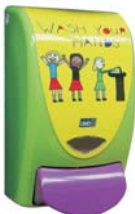
DEBSD1 DEB Children's Soap Dispenser

Manufactured from impact resistant ABS with level indicator & locking mechanism. Inc. 1Ltr soap cartridge.