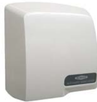
B-710E Bobrick Hand Dryer

Surface mounted hand dryer in Auto Grey. Concealed air intake with a no touch operation. Auto cycle shut off saving energy and operating costs.