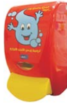
DEBMSS1 Mr Soapy Soap Dispenser

Manufactured from impact resistant ABS with level indicator & locking mechanism. Inc. 1Ltr soap cartridge.