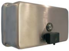
B-2112 Stainless Steel Soap Dispenser

In brushed Stainless Steel with level indicator & key locking system. Capacity 1.2 litres.