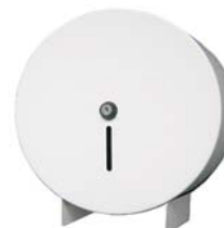
UNITR1 Unisafe Jumbo Toilet Roll Holder

300mm Diameter white powder coated metal dispenser with refill window & key locking system.