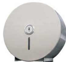
B-2890 Jumbo Toilet Roll Dispenser

In brushed Stainless Steel with level indicator & key locking system.