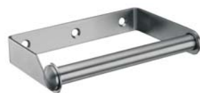
T610 Budget Toilet Roll Holder

Satin stainless steel finish. Suitable for 13mm and 20mm board. Concealed Fix. Wood screws supplied.