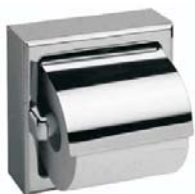
B-66997 Satin Toilet Roll Holder

Surface mounted toilet paper dispenser with hood. Bright polished stainless steel. Hood protects paper. Chrome-plated plastic spindle.