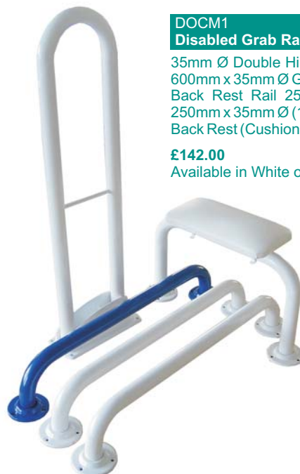
DOC M1 Disabled Grab Rail Set

35mm Ø Double Hinged Grab Rail (1) 600mm x 35mm Ø Grab Rails (3) Back Rest Rail 250mm x 400mm x 250mm x 35mm Ø (1) Back Rest (Cushion Only)