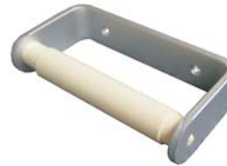
SEA06 Standard Toilet Roll Holder

Satin Anodised Aluminium with plastic removable insert. Suitable for 18/19mm Board.