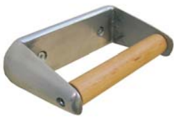
PEA06 (SAA) / PEW06 (White) Vandal Resistant Toilet Roll Holder

Vandal Resistant with lockable wooden insert, available in White powder coated or Satin anodised aluminium. Suitable for 18/19mm Board.