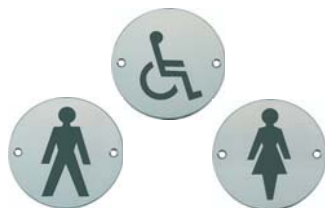
DSB1-Male/Female/Disabled Satin Stainless Steel Door Symbol

Black silk screened symbol. Satin stainless steel plate drilled and countersunk (fixing screws included).