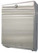
B-262 Bobrick Paper Towel Dispenser

Dispenses 400 C-fold or 525 multifold towels in a brushed Stainless Steel door to be fitted with piano hinge & tumbler lock.