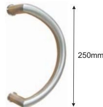
DH250 Stainless Steel 250mm D Handle

Satin Stainless Steel 25mm diameter semi-circular pull handle with bolt through disc.