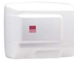
LE48 Baby World Automatic Hand Dryer

Tough durable die cast aluminium cover, baked enamel finish. Automatic activation, corrosion resistant materials and tamper resistant screws.