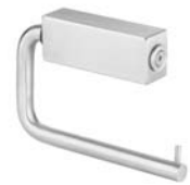
T600 Deluxe Toilet Roll Holder

Satin stainless steel finish. Suitable for 13mm and 20mm board. Concealed Fix. Wood screws supplied.