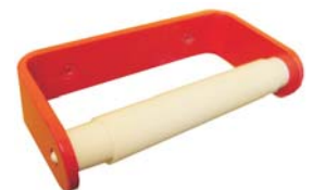
CC06 Harlequin Toilet Roll Holder

With plastic spindle and available in Red, Blue or Yellow powder coated aluminium. Suitable for 18/19mm Board.