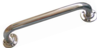
GRB600S Stainless Steel 600mm Grab Rail

Manufactured in 35mm Stainless Steel with a satin polished finish.