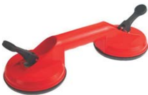
DSPL1 Double Sucker Panel Lifter

Double suction anchor pad. Maximum lifting capacity of 65kg. Use two to handle glass.