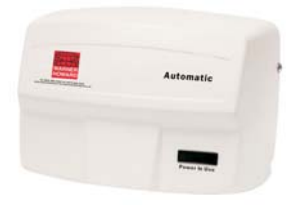
SM48 Hand Dryer

Vandal resistant aluminium cover, powder coated baked enamel in white finish. Corrosion resistant materials and tamper resistant screws.