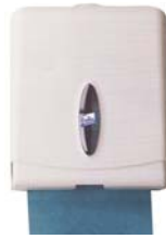
UNIPTD1 Lotus Paper Towel Dispenser